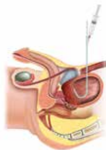
3. Deflate balloon of in-situ catheter using empty 10ml syringe