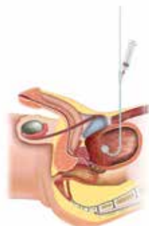
6. Once the catheter is within the bladder, inflate catheter balloon, via Luer valve to the volume indicated on the catheter and packaging using pre-filled syringe of glycerine solution. NB. If there is any uncertainty regarding the position of the catheter do not inflate balloon as this may harm the patient.