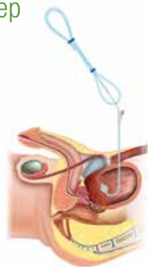
2. Insert flexible end of two-stage guidewire into catheter drainage lumen