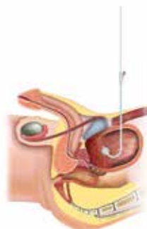
7. Remove the guidewire.