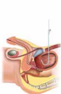
5. Insert the new catheter over the guidewire until the bladder is reached