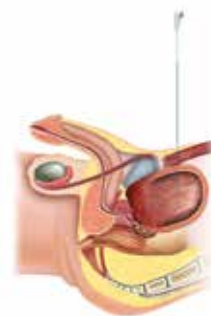
4. Remove catheter over guidewire making sure to leave the guidewire in position