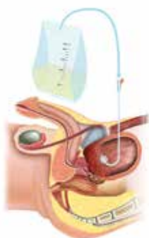
1. Remove urine collection device from distal end of catheter