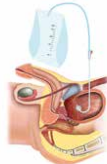
8. Attach suitable sterile urine drainage device to catheter.