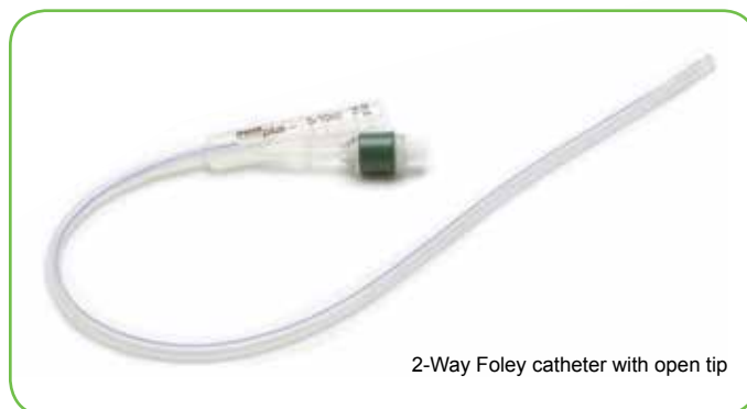
2-Way Foley catheter with open tip