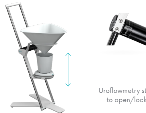
Portable version with a folding stand

Uroflowmetry stand is easy to open/lock and adjust the height.